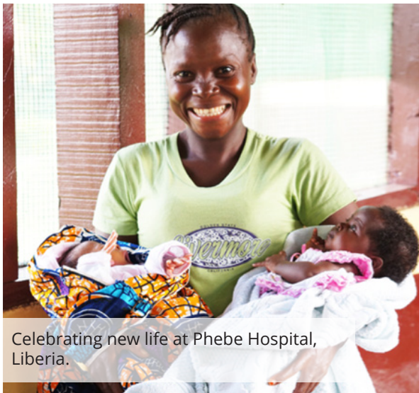
Celebrating new life at Phebe Hospital, Liberia.