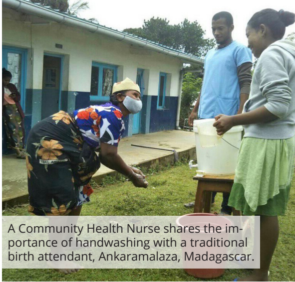
A Community Health Nurse shares the importance of handwashing with a traditional birth attendant, Ankaramalaza, Madagascar.