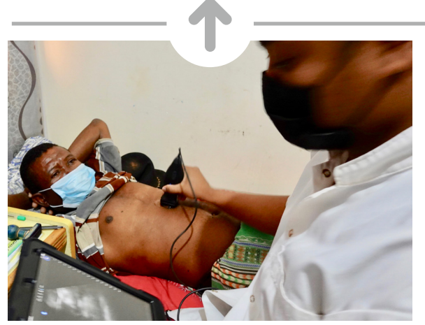
Some enthusiastic doctors began using GHM-sent handheld ultrasounds even before formal training.