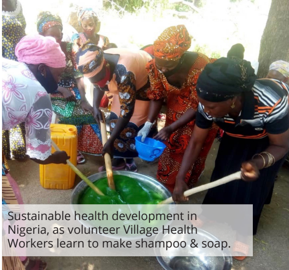
Sustainable health development in Nigeria, as volunteer Village Health Workers learn to make shampoo & soap.