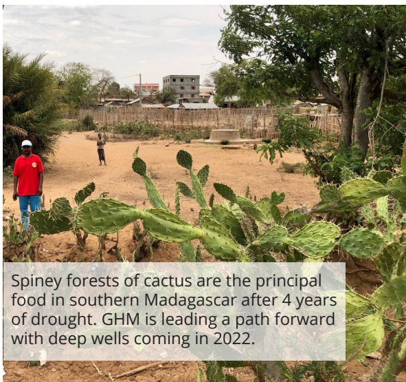
Spiny forests of cactus are the principal food in southern Madagascar after 4 years of drought. GHM is leading a path forward with deep wells coming in 2022.

responded, and continues to respond, to calls from around the globe for PPE, oxygen, support for community health workers, and even enhanced treatment facilities. We've linked hands in prayer as well, and engaged virtually in mutual encouragement with country partners around the globe. Thank you to each and every volunteer and staff member for your deep engagement, to professional researchers for continued insight, to generous donors that empower us to act, and for faithful prayer that moves mountains. All of these are vital, not simply in response, but as preparations to equip all of us for whatever comes next.