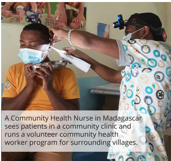
A Community Health Nurse in Madagascar sees patients in a community clinic and runs a volunteer community health worker program for surrounding villages.