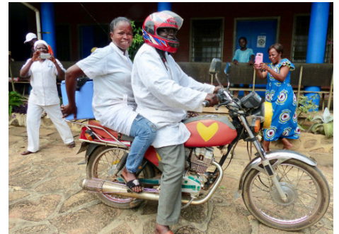
Health workers in the Central African Republic bring immunization by motorcycle to people in remote areas, carrying precious vaccines in a cooler on the back of their bike.