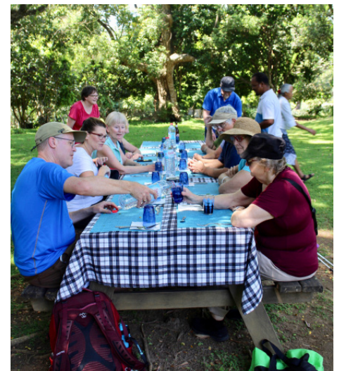
Lunch al fresco, Nahampoana Nature Reserve

GHM is considering hosting another Vision Trip in the next 18-24 months. Stay tuned!