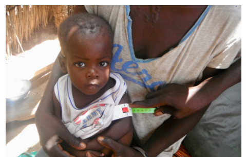
Volunteer health workers in Nigeria are improving health and creating sustainable outcomes as they teach their neighbors about healthy pregnancies and monitor growth and malnutrition in children. Measurements tell the story.