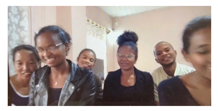
SEFAM's first cohort of Community Health Nurses

Madagascar is anything but ordinary. A biodiversity hotspot, 90% of its plants and animals are found nowhere else on the planet; it is the world's leading exporter of vanilla; and it is the 4th largest island in the world – over three times the size of Great Britain. But it is also among the poorest of countries, with nearly 3 out of 4 people living in extreme poverty (less than $2/day).