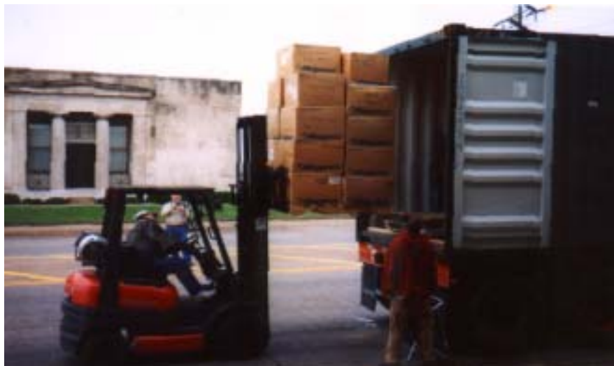
A volunteer fork lift operator eases boxes into a 40 ft container being sent to Liberia. This shipment, the fourth they have sent, was prepared and shipped by First Lutheran Church and other congregations in the Cedar Rapids, IA, area.