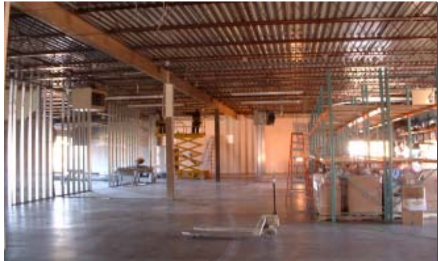
Interior of new warehouse showing new pallet racks and volunteer work space walls going up for supplies sorting, lab/surgical instruments, and medical equipment repair.

Global Health Ministries 7831 Hickory Street NE Minneapolis, MN 55432 763/586-9590 • FAX 763/586-9591 email address: ghmoffice@cs.com Internet: http://www.ghm.org