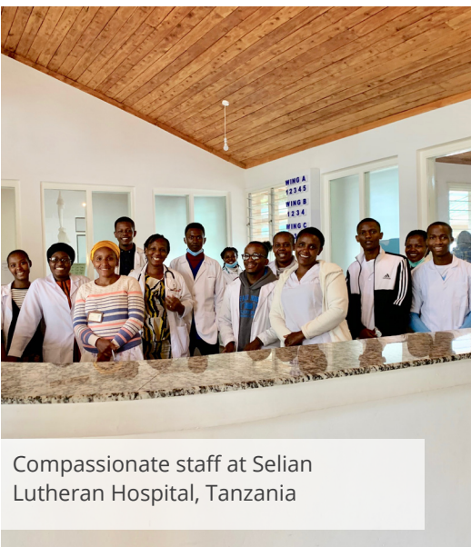
Compassionate staff at Selian Lutheran Hospital, Tanzania

On the east coast of Africa, Tanzanian doctors, nurses, and a large medical staff struggle to accept that many patients are too poor to pay for any treatment or medications. The staff see their work as more than a job, and more than charity ... this is their way of saying, "Here I am, Lord, use me." Every morning, they gather for prayer before reporting for their duties in the hospital and sometimes they dedicate their offerings to pay for the poorest patients. It's a sort of "Charity Fund," but meager. This is another way GHM partners, to offer funds to this Charity Fund, distributed through a social worker and overseen by the administrator of Selian Lutheran Hospital. Even as these funds are shared, GHM's consulting arm, GHAP, has partnered with an expert team of volunteer healthcare administrators, business and other health professionals to offer ideas and counsel which Selian has used to diligently turn around their operations, dramatically reduce their debt, and pay staff salaries on time each month.