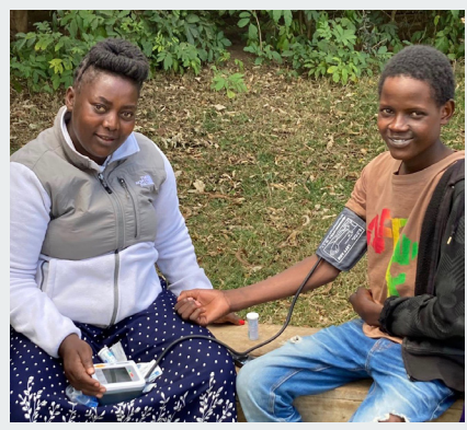
Community Health Worker training, TZ

Health workers are special people. Often they choose this career because they are genuinely seeking ways to improve people's lives, to change the world. Many associated with GHM are intentionally