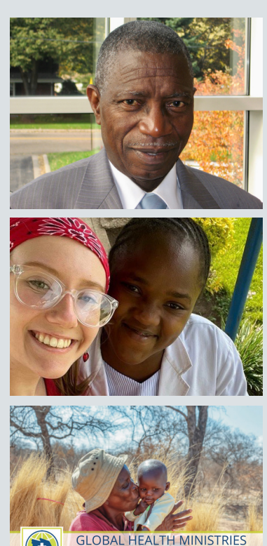
IMPACT REPORT 2021

GLOBAL HEALTH MINISTRIES 7831 Hickory Street NE Minneapolis, MN 55432 763.586.9590 office@ghm.org