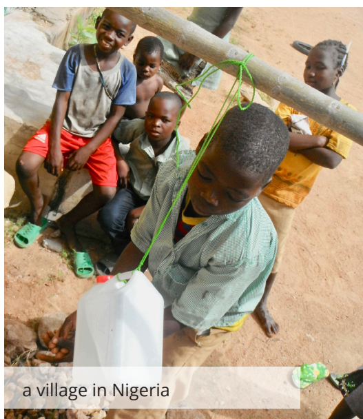
a village in Nigeria

Global Health Ministries (GHM) has worked for over a decade with the Lutheran Church of Christ in Nigeria (LCCN) to help them achieve this powerful shift. As COVID-19 hit this year, nothing was more vital than this approach of educating and mobilizing communities.