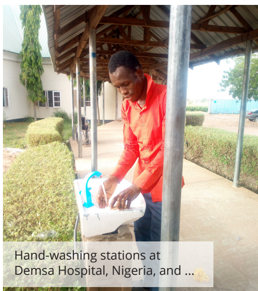
Hand-washing stations at Demsa Hospital, Nigeria, and ...