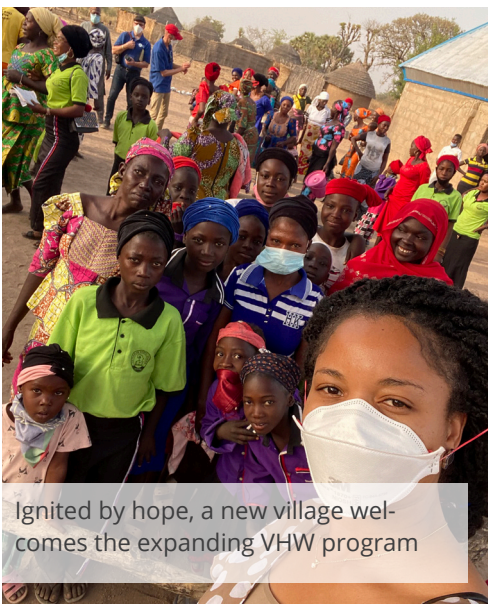
Ignited by hope, a new village welcomes the expanding VHW program

Even as we wait, God inspires the faithful to bring hope through ordinary acts of justice and kindness.