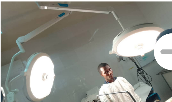
New surgical lights at Dodoma Christian Medical Centre