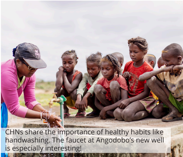
CHNs share the importance of healthy habits like handwashing. The faucet at Angodobo's new well is especially interesting!

Each one believes that God has called them to serve ... to bring abundant life, in Jesus' name.