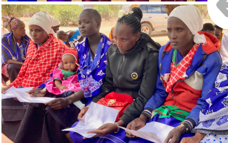
CHWs serving among the Maasai in Tanzania, pictured in 2014 with GHM First Aid Kits at the start of the project (top) and concentrating on training in July, 2023. Most are illiterate so the data collection forms use pictures - it's critical to make sure the meaning is clear.