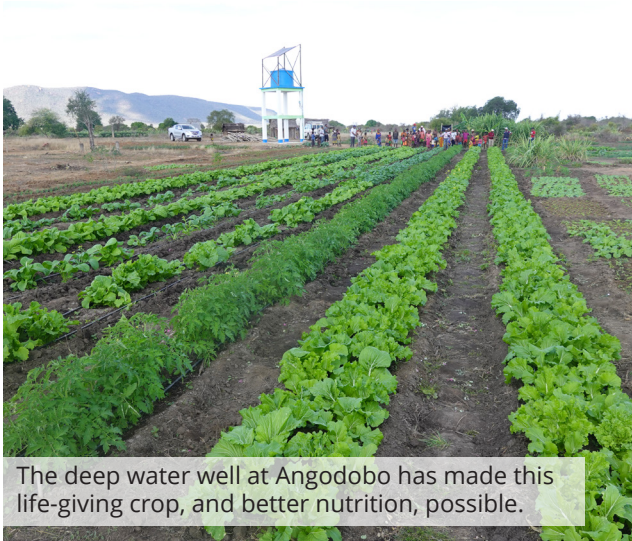
The deep water well at Angodobo has made this life-giving crop, and better nutrition, possible.

In July I visited one of these sites in southern Madagascar, in the Androy region. Water is scarce here and malnutrition is the norm for over a million people impacted by the persistent drought that has plagued this region. Here the CHNs are integrated into a water project sponsored by GHM together with partner Foundation, Seeds of Change. Using geological techniques associated with finding oil, GHM is partnering with SALFA (the Malagasy Lutheran Health Department) to locate water deep beneath the surface. This "Deep-Seated Water" is clean, abundant all year round, and doesn't depend on rainfall.